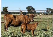
TTT CALAMITY JANE