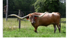
DEL RIO CHEX