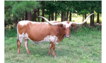
WIREGRASS SMOKIN 44